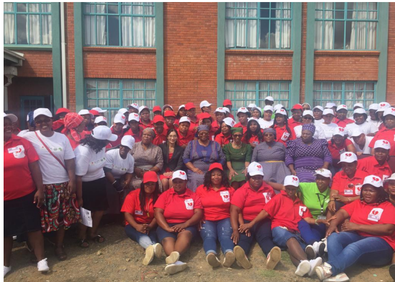
Right - Domestic workers association in Gauteng province, South Africa during the TIP sensitization campaign (December 23 2019)

"Based on the partnership built through the two previous projects, IOM will implement the project with the Ministry of Home Affairs (MoHA) as a key counterpart, but also cooperate with other relevant Ministries and institutes, Cross Border Crime Prevention Forum between South Africa and Lesotho, Non-Government Organizations (NGOs) active in counter trafficking activities, District Authorities as well as Basotho diaspora members, church leaders and village leaders. In order to fight against human trafficking, we need to collaborate with everybody who shares with us the common goal. Our shared goal is to realize Lesotho free from this inhuman crime – human trafficking" said Ms. Eriko Nishimura, Head of Office of IOM Lesotho.